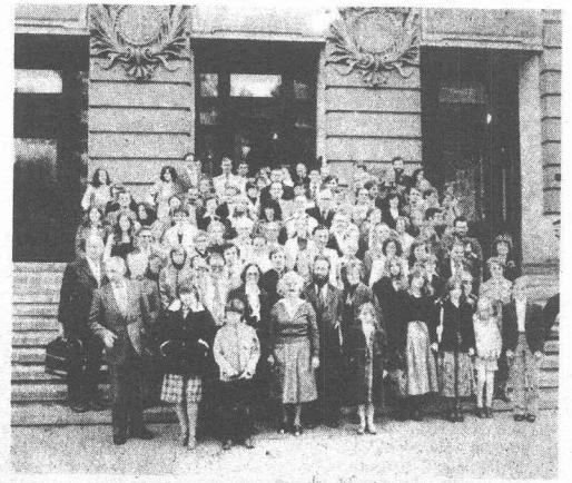
CARLSBAD FEASTGOERS — Some of the brethren attending this year's Feast of Tabernacles in Carlsbad gather in front of the meeting hall.

After months of such Ping-Pong decisions, a hall was finally reserved — the day before everyone arrived. The room was decorated with turn-of-the-century architecture, normally only used for official state functions. During services, simultaneous translations were provided for the English-speaking members so they could also benefit from the ser-