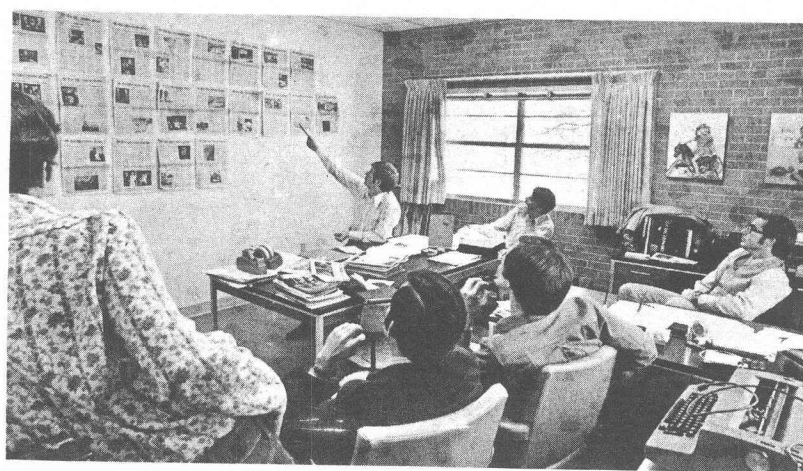
BRAINSTORMING — The production staff of The Worldwide News plans the 1975 year-end wrap-up issue. Front pages of all 1975 editions are on the wall in the