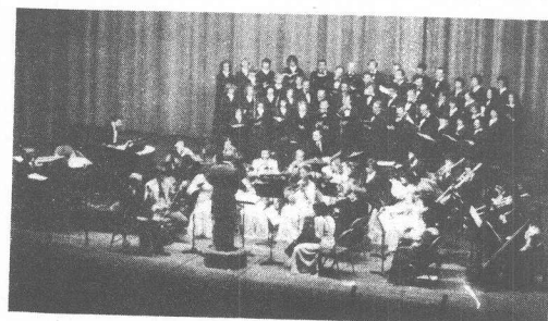
FIRST CONCERT — The Minneapolis-St. Paul, Minn., chorale performs its first concert at the St. Paul Civic Center April 13. (See "Church Activities," this page.)

The NELSON, New Zealand, church welcomed 14 young people from the WELLINGTON, New Zealand, church to a four-day stay on South Island during the Days of Unleavened Bread. A family dance evening included a lively fun show. A picnic and sports afternoon featured enjoyable games of soccer and softball. During the last day of Unleavened Bread the hope was expressed that another visit be arranged for next year. Then, the Well-