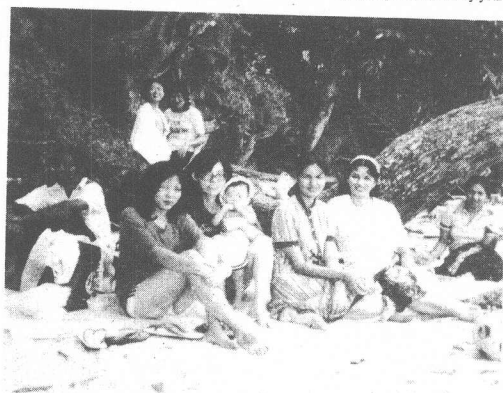
TROPICAL PICNIC — Kuala Lumpur, Malaysia, brethren relax on a beach at the former Feast site of Port Dickson, Malaysia, Sunday, April 27, for food, fun and fellowship. (See "Church Activities," this page.)