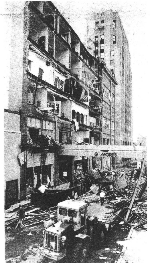
TORNADO AFTERMATH — Kalamazoo, Mich., residents begin cleanup following May 13 storms and tornado. Two persons died or injured outside the devastated department store as the winds ripped the wall onto the street.

A number of Worldwide Church of God brethren and family members were working in the buildings battered by the storm-driven winds. Their story of escape and protection is a story of safeguarding from a higher Guardian.