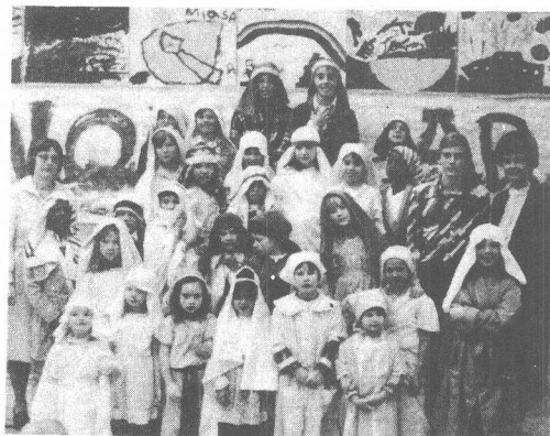
NOAH'S ARK — The Arlington Heights, Ill., junior choir in their ancient garb pause for a few moments at their April 26 special performance of an arrangement of the cantata Noah's Ark. (See "Youth Activities," page 10.)

The PHOENIX, Ariz. , Spokesman Club had a barbecue at the Armstead farm