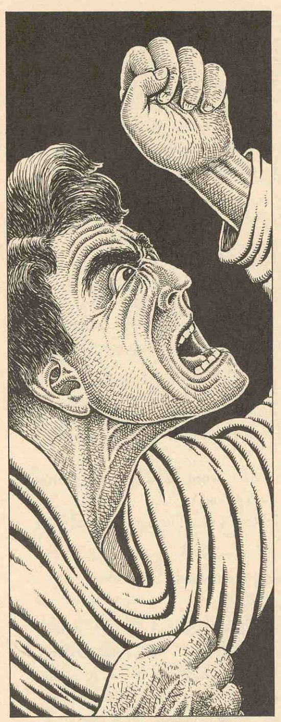
The Egyptian-Israelite broke into a rage and began to curse the Creator.

Thus a new rule came from the Eternal to force obedience to the Third Commandment. The penalty of death by stoning—a form of capital punishment—was to apply to any person who spitefully and hatefully pronounced vile and profane words against the One who had created him.