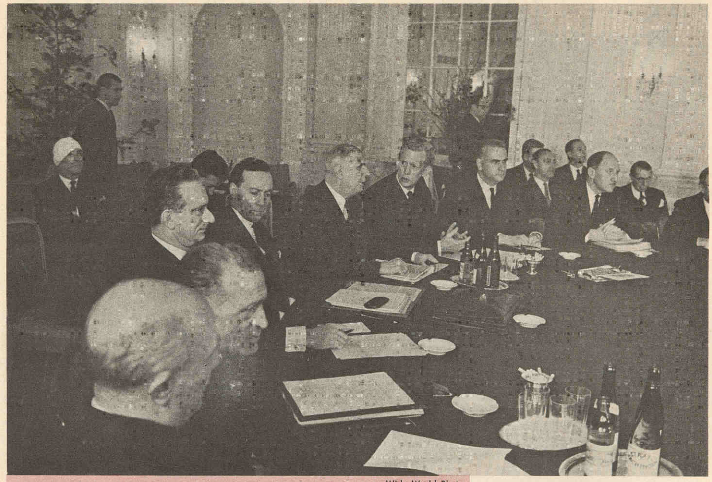
Two scenes from the Little Summit Conference meeting at Bad Gotesberg, July 18, 1961. Represented are chiefs of the six European Common Market nations meeting to work out program for political cooperation.

guide will proudly point it out as "THE NEW CAPITAL OF EUROPE!"