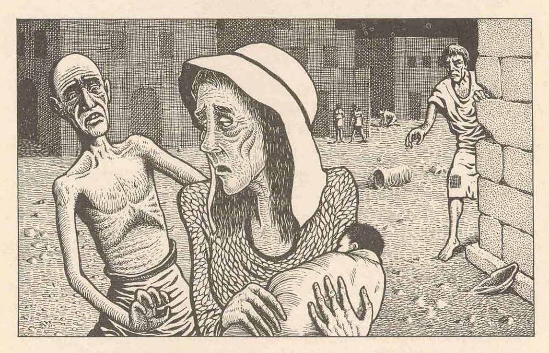
God warned the Israelites that if they kept on disobeying Him, they would come into such terrible poverty that they would some day eat their own children!

It hardly seems possible that any of the Israelites would become cannibals. But just as God warned, it turned out that way in Jerusalem many years later when their enemies cut them off from their food supplies in the year A.D. 70.