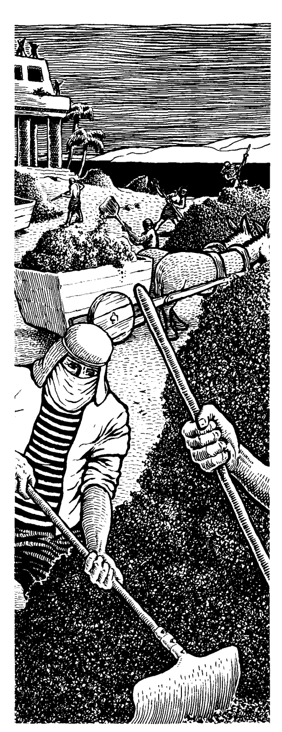
The Egyptians were still working hard to clean up the heaps of dead frogs when Moses warned of a Third Plague to come.

"Do something!" he commanded. "Prove again that our gods can produce miracles!"