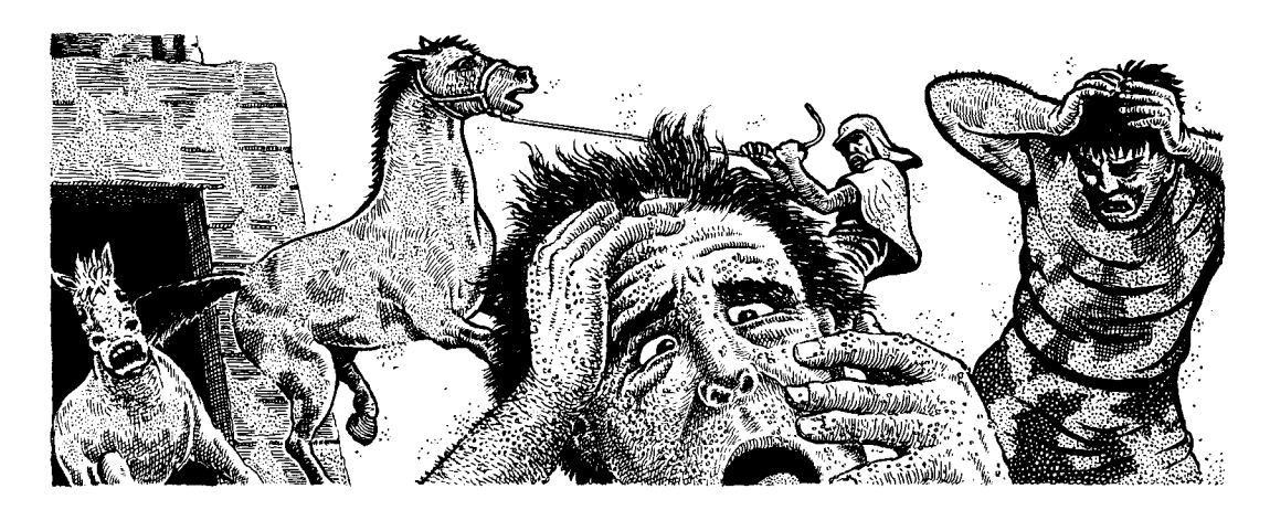
People and animals moaned in agony as their bodies became matted with the stinging insects.

Perhaps the magicians had performed their former amazing tricks through clever, natural means. Perhaps they had been helped by evil spirits. Or possibly there was a combination of both. Whatever the means, it didn't seem to be with them as they stood in fearful embarrassment before the king. The head magician suddenly bowed low, and it was plain that he was trembling.