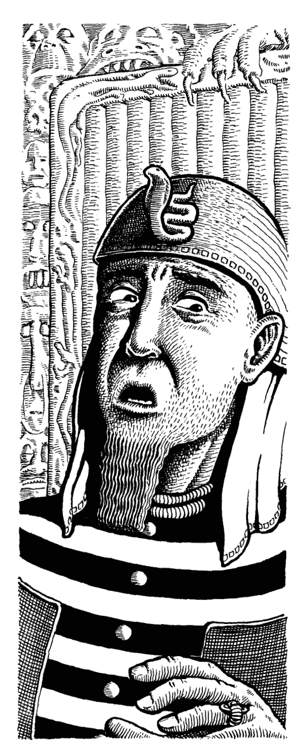
Pharaoh's bearded chin dropped at sight of the thing on the floor.

"I don't think," he told them, "that your God can do any more than our gods can do."