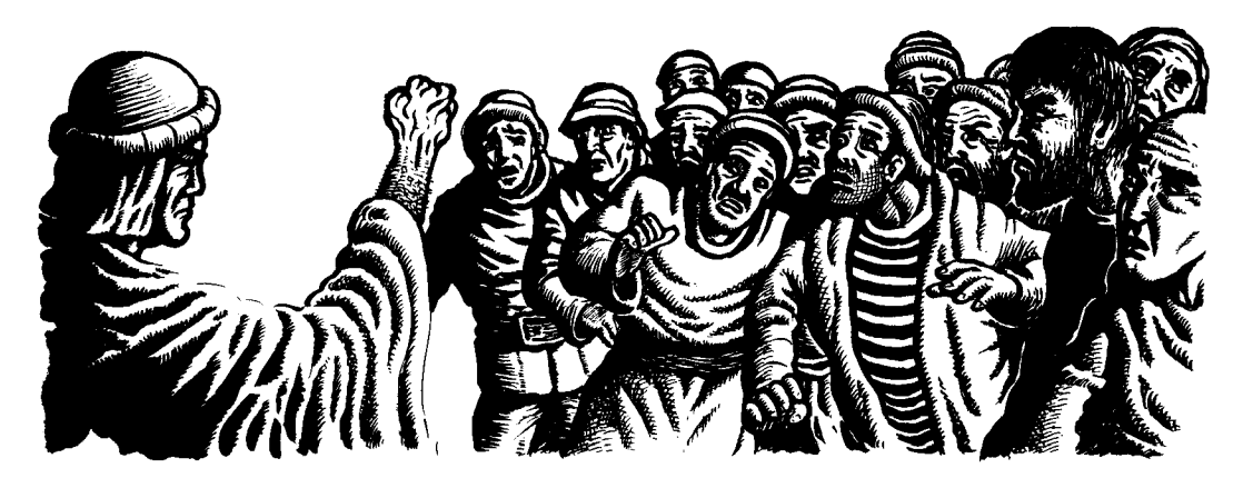
Moses held up his hand for the elders to see that it was only a white, decayed stub.

Now there was silence as Moses held up his right hand for all to see. He put it inside his jacket for a few seconds, then withdrew it to show a white, leprous, decayed hand that brought a chorus of cries of horror from the crowd. A moment later, when