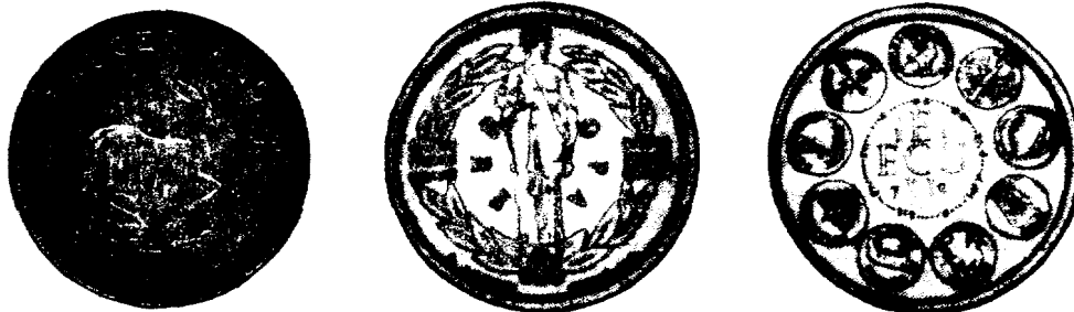
The Krugerrand (left) and the ECU

"Highly important, but little publicised was the announcement recently that the European Economic Community (EEC) would issue a gold coin, the ECU (pronounced Eh-Cue), marking the first coined money of the European Monetary System and the EEC.