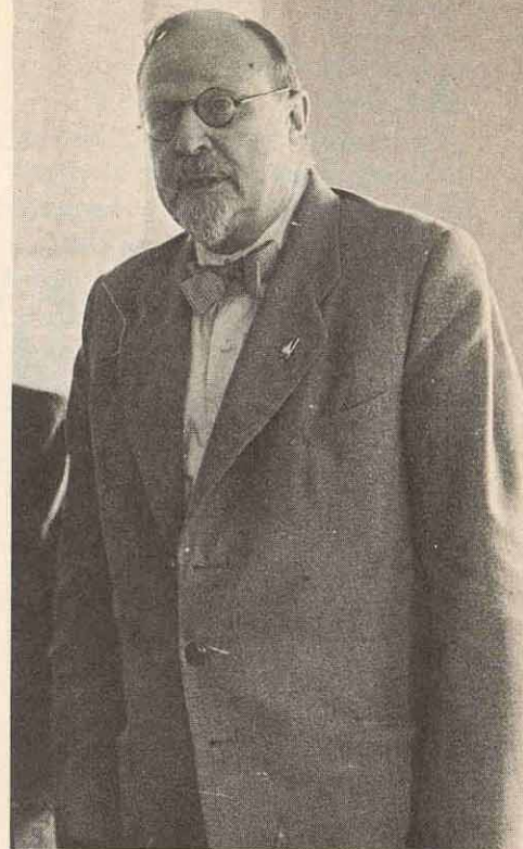
Professor A. I. Oparin, one of the Soviet Union's leading biochemists and a strong believer in the theory of evolution.

Evolutionists also know that scientists have kept bacteria cultures for years,