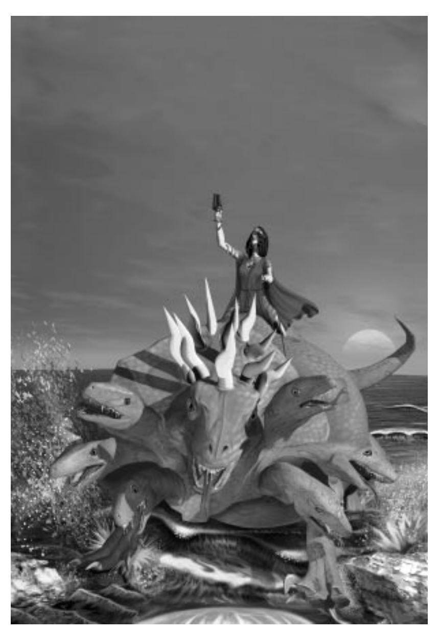
Revelation 17 describes a woman—understood to represent a false religious system—who "rides" a "beast" representing an end-time revival of the Roman Empire. ©TW Illustration—Courtesy of Bruce Long.