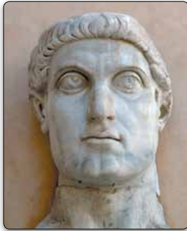
The Roman emperor Constantine the Great, while himself not really a Christian, convened and played a major role in the Council of Nicaea, which laid the groundwork for acceptance of the Trinity doctrine.

Let us be clear that when it comes to the intellectual and theological debates in those early centuries that led to the formulation of the Trinity,