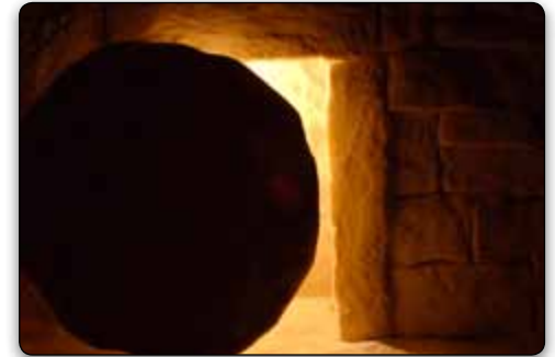
Scripture describes Jesus Christ existing as God with the Father before His human birth. The evening before His crucifixion, He prayed to be restored to the glory He had earlier shared with the Father—which came to pass after His resurrection.

Paul tells us that we should have the same humble, serving attitude of Jesus Christ, “who, although He existed in the form of God, did not regard equality with God a thing to be grasped [i.e., tightly held on to], but emptied Himself , taking the form of a bond-servant, and being made in the likeness