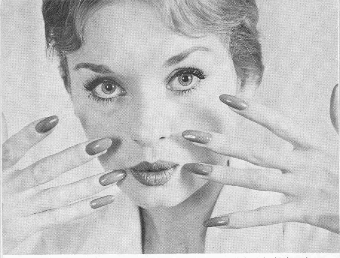
Example of a woman painting over the jewel. The true beauty comes from within and cannot be "painted on"!

hidden person (INWARD ADORNING) of the heart with the imperishable jewel of a gentle and quiet spirit, which in God's sight (but not in the sight of the world) is very precious. So once the holy women who hoped in God used to adorn themselves and were submissive to their husbands" (I Pet. 3:1, 3-5, Revised Standard Version).