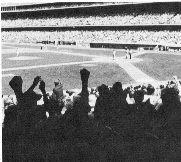
Center: Wide World; all others, Ambassador College