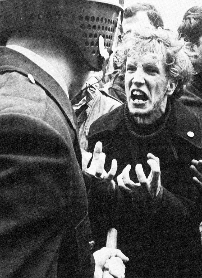
DRAMATIC CONTRAST —It is difficult to realize that the enraged individual at right was once a humble, sweet little child. What inspires the undesirable traits of "human nature"?

The mind of man, under the influence of Satan's broadcasting, loves itself above all else. It is selfish. Next to itself, it loves that which belongs to it or is in some way connected to it—persons, material possessions, concepts, etc. All of these are a part of a larger "self"—like a little "empire." This is the "self" that humans love ahead of any "outsider," especially God.