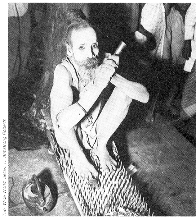
ACTS OF PENANCE —At top, Philippine flagellants voluntarily submit to flogging in a religious ceremony. Above, a Hindu "holy man" sits on a bed of nails. Various acts of penance will not forgive sin. One cannot avoid the eternal penalty of sin by punishing himself for his sins.