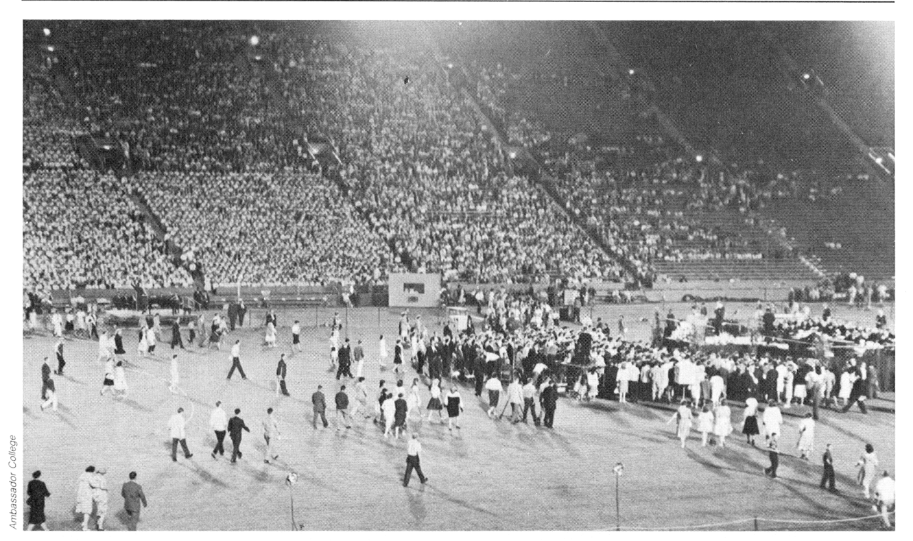
ALTAR CALL —Several at this "revival" service "gave their hearts to the Lord" during an emotion-packed appeal by the preacher. But did they really understand the meaning of true repentance?

pray, and I knew that in prayer I was talking with God. I was not yet very well acquainted with God. But one gets to be better acquainted with another by constant [daily] contact and continuous conversation."