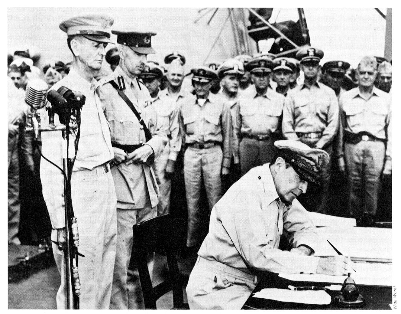
UNCONDITIONAL SURRENDER —The signing of World War II Japanese unconditional surrender documents, shown here being accepted by General Douglas MacArthur aboard the USS Missouri on behalf of the United States, illustrates the complete surrender to God of those who have truly repented.

pied the conquered territories and enforced the will of the occupying powers. No one thought it strange that the conquering powers should claim the right to tell the defeated Axis Powers what to do—to interfere with and regulate the lives of the conquered. This is the same right that God claims once we have surrendered to Him.