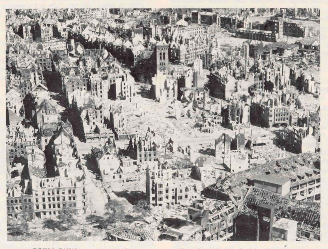
TOTAL RUIN — Hanover, Germany lay in utter ruin at the end of World War II. West Germany, member of the European Economic Community, has been completely rebuilt, and now has one of the strongest economies in the world.

To many observers on the world scene, it appears that no less than a miracle has occurred. At